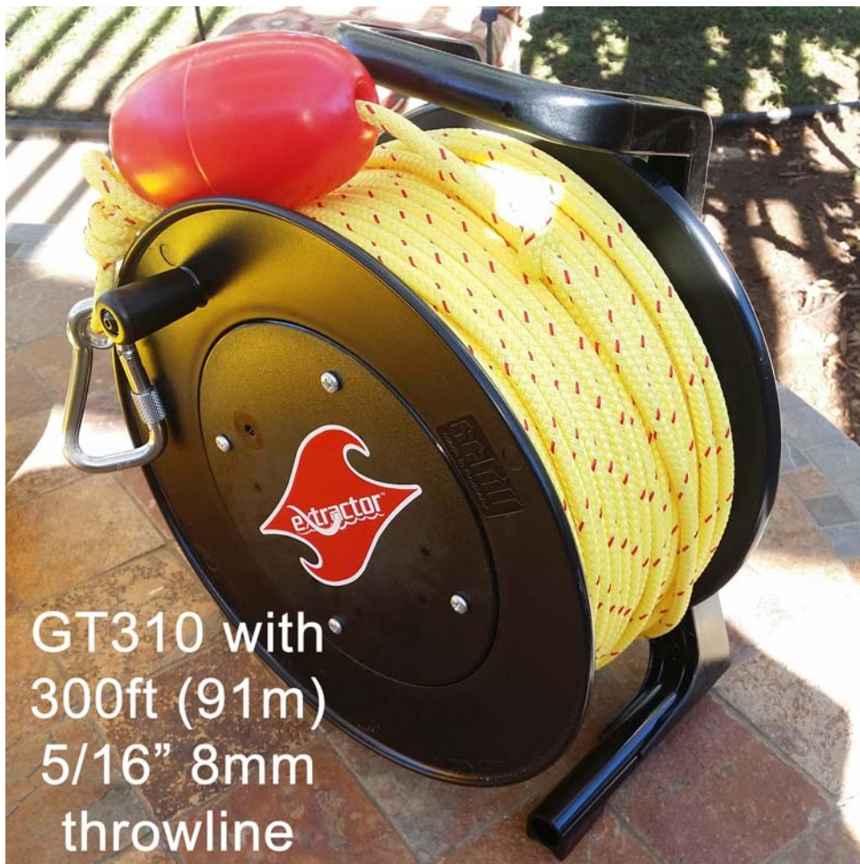
GT310 with 300ft (91m) 5/16" 8mm throwline